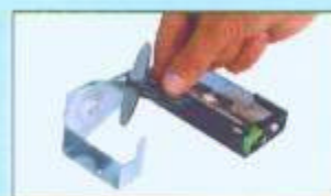
Position of rewinder wheel can be modified to your need