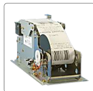
Interface : Serial(RS232C)