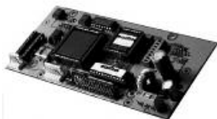
Control interface ITP-1703